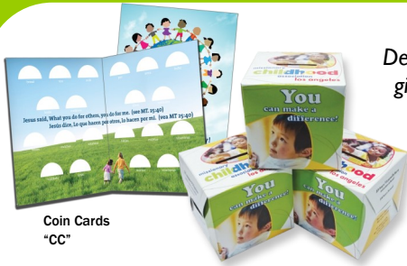
Coin Cards "CC"

MCA Coin Cards & Mite Boxes Designed to encourage young people to give from their hearts, these can be used for sacrificial giving during World Mission Month, Advent, Lent, Extra Mile and Sharecare with our Fall and Spring newsletter, World Mission Rosary material, prayer card or alone. (one box/coin card per student, per collection) Please reuse mite boxes/coin cards whenever possible!