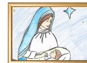
St. Cyril of Jerusalem in Encino, CA