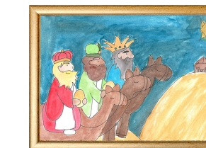
All Souls in Glendale, CA