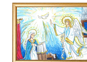
Resurrection in Los Angeles, CA