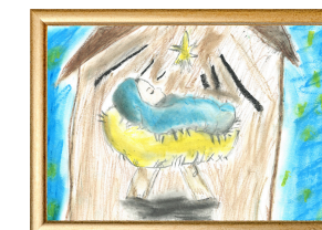
St. Gregory the Great in Whittier, CA