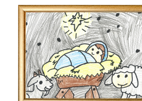
St. Gregory the Great in Whittier, CA