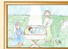
Incarnation in Glendale, CA