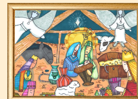
Cathedral Chapel in Los Angeles, CA