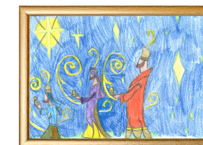
St. Gregory the Great in Whittier, CA