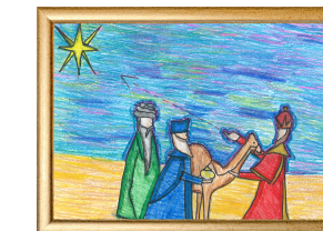
Beatitudes of Our Lord in La Mirada, CA