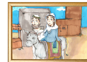
All Souls in Glendale, CA