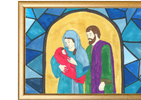
St. Cyril of Jerusalem in Encino, CA