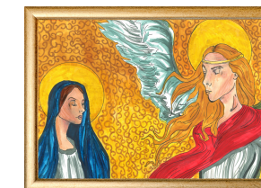
Our Lady of the Assumption in Claremont, CA