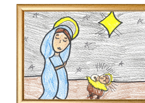
Incarnation in Glendale, CA