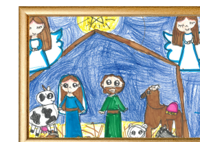
St. Gregory the Great in Whittier, CA