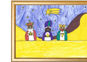
All Souls in Glendale, CA